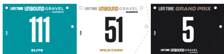
SEAT POST PLATES